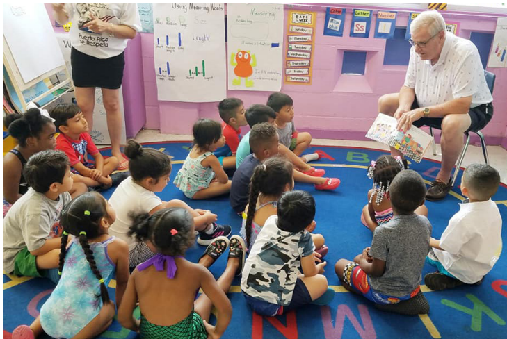
Volunteers from New Vision Pioneers spent the day reading to the children