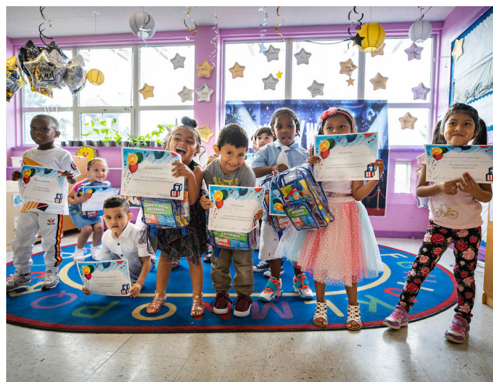
Patterson Park students proudly displaying their certificates of completion