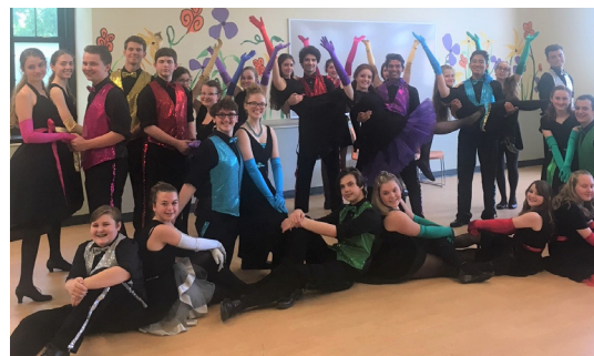
Voices in Praise performers

The University Maryland Medical System — Population Health Quality Care Network volunteered their time for lunch meal service at our Beans and Bread Center.