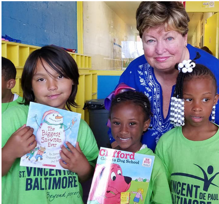
Children from Camp Discovery chose books from the new library to read at home

Thank you New Vision Pioneers — Maryland Chapter for visiting the SVDP's Patterson Park location and donating over 1,000 books! The children were thrilled to pick out 2-3 books to take home for summer reading and have such a wonderful classroom library. Volunteers also read to the children and provided a great reading experience for the children of Camp Discovery and Camp St. Vincent.