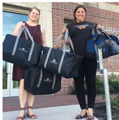
Members of the Comcast NBC Universal team stopped by Sarah's Hope Mount Street to drop some much needed blankets and toiletries

Thank you Comcast for donating and delivering 100 duffel bags filled with blankets and other supplies for Sarah's Hope residents! Comcast NBCUniversal is proud to drive positive social change in our communities.