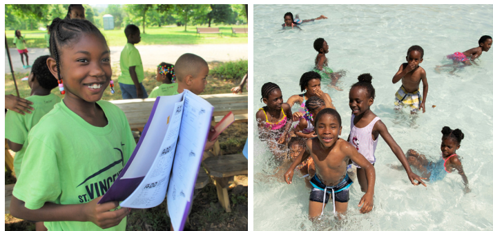
Campers working hard to maintain their math and swim skills over the summer