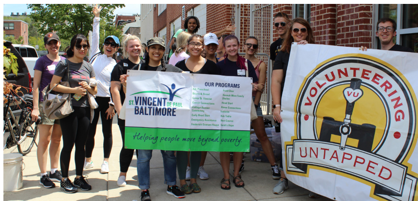
Volunteering Untapped street clean-up team