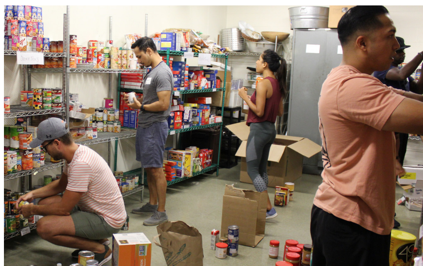
Volunteers organizing the Beans & Bread pantry