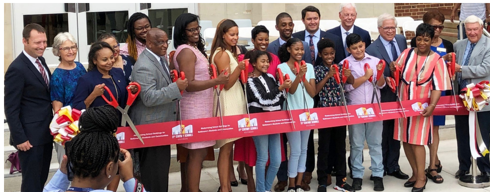
21st Century Ribbon Cutting Ceremony in front of Arlington Elementary School

St. Vincent de Paul of Baltimore staff and leadership joined Baltimore City Schools in an August 28 celebration at the city's newest 21st-Century school building — Arlington Elementary School. SVDP was honored as part of the festivities as the operator of the new state-of-the-art, Harry and Jeanette Weinberg Early Childhood Development Center at Arlington Elementary, located in the Park Heights neighborhood.