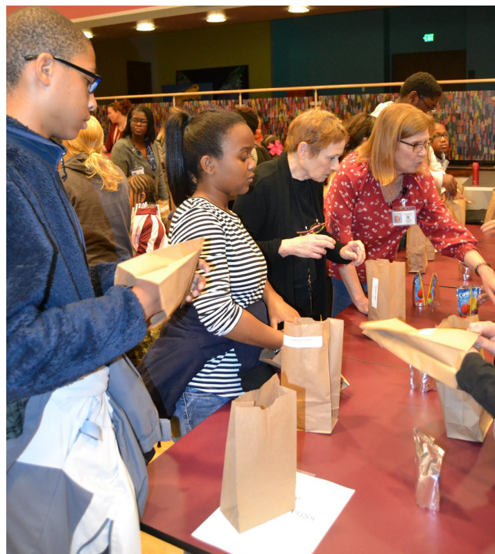
Students from the Maryland School for the Blind assembling breakfast bags.

MSB students, led by their social work and speech departments, worked together on a new monthly community service project. For their fall project, students in grades 1-12 created breakfast bags for people experiencing homelessness at the Beans & Bread Center. High School students served as leaders and role models for the younger students. This collaborative project allowed the students to not only give back to the community, but to increase social skills, leadership, and foster teamwork!