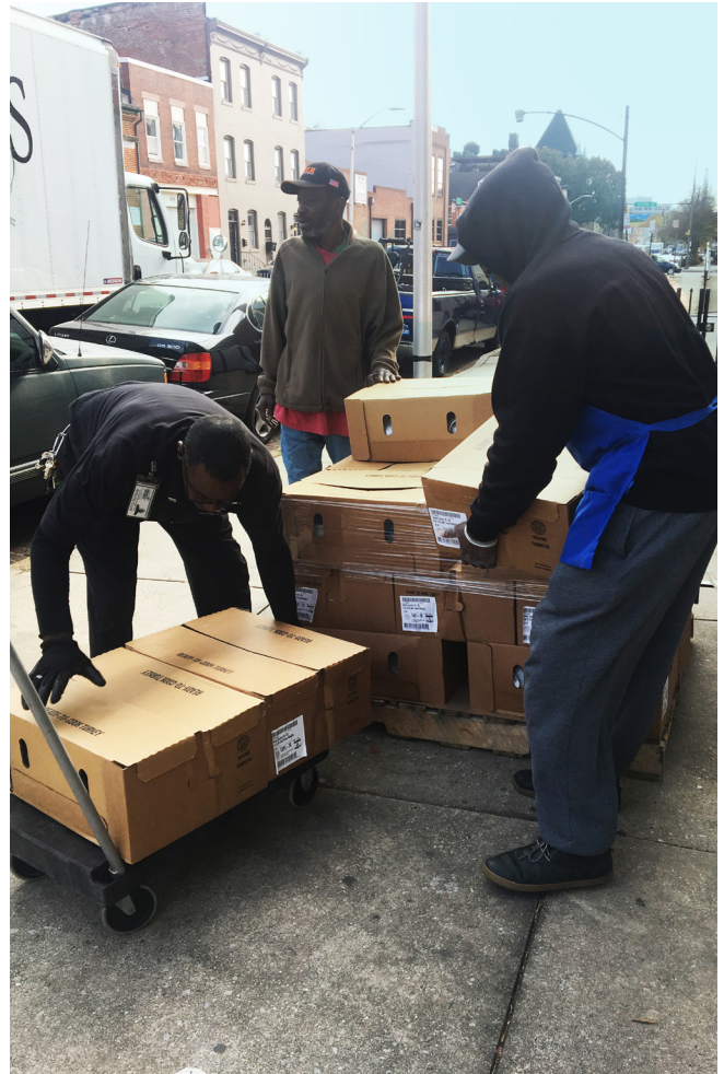
Beans & Bread staff taking good care of the turkeys