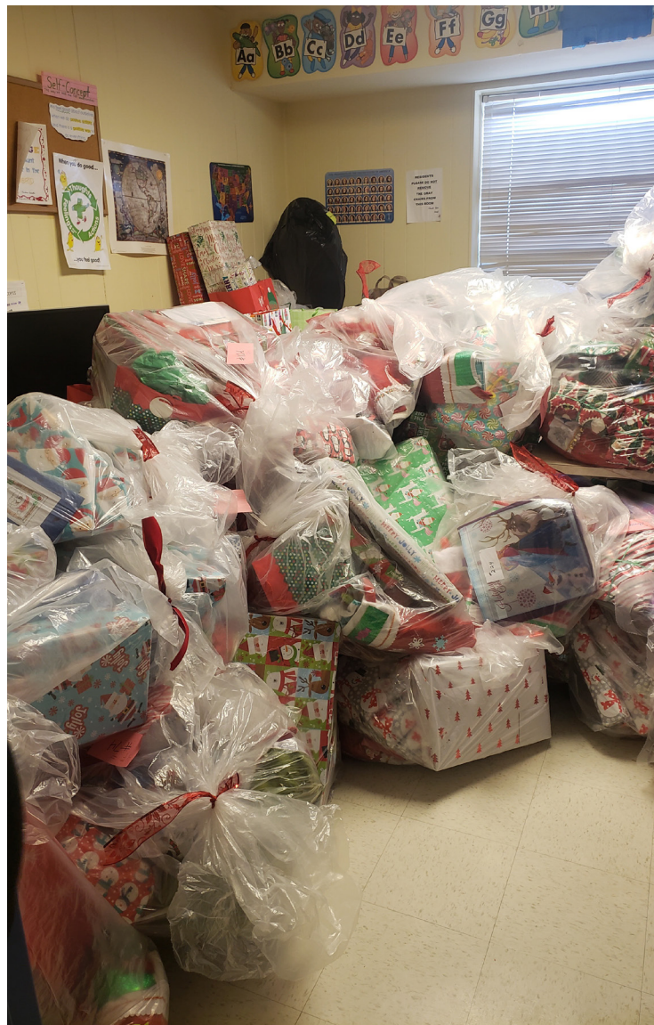
Thanks to the loyal support of Knights of Columbus at St. Gabriel's Church, 16 families were adopted.