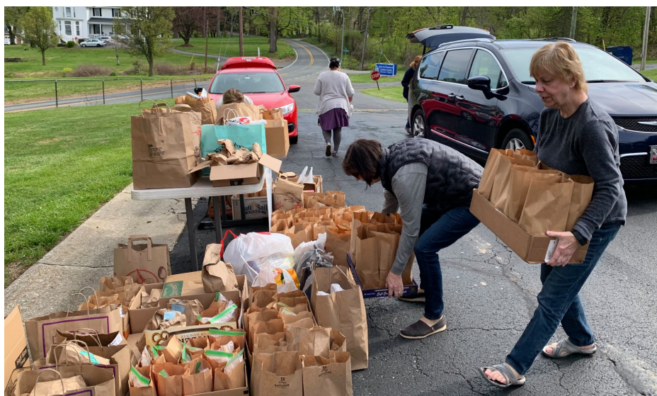
St. John the Evangelist School, Long Green Valley conducted a bagged lunch collection for Beans & Bread to help us continue serving meals to those in need.

If you or your company is able to assist, please contact giving@vincentbaltimore.org for more information.