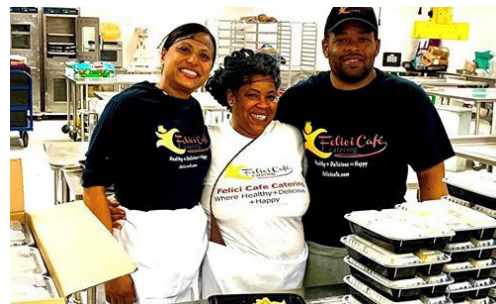
Felici Café has been providing over 600 meals per week to Beans & Bread. Their delicious food is homemade with fresh, healthy ingredients and is delivered to Beans & Bread Monday through Saturday.