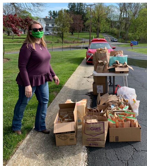
St. John the Evangelist, Long Valley volunteers ensured social distancing with their curbside drop off system.