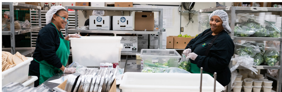
We have increased the number of volunteers at our community kitchen, KidzTable to prepare meals that are being delivered in the Baltimore area.