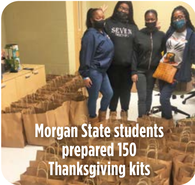
Morgan State students prepared 150 Thanksgiving kits