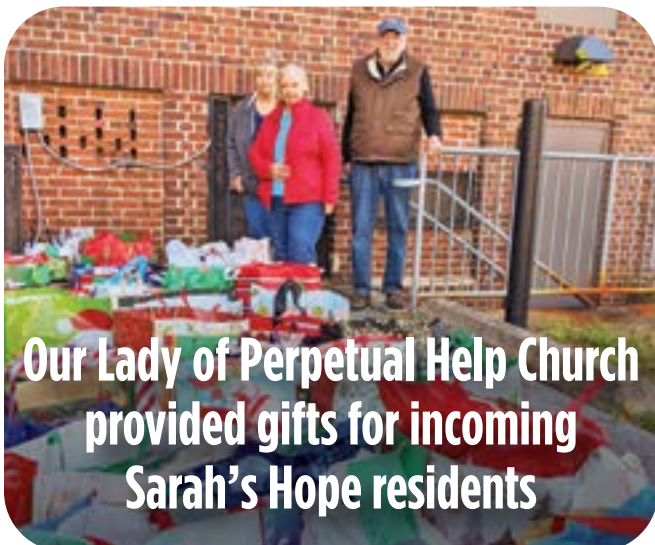
Our Lady of Perpetual Help Church provided gifts for incoming Sarah's Hope residents