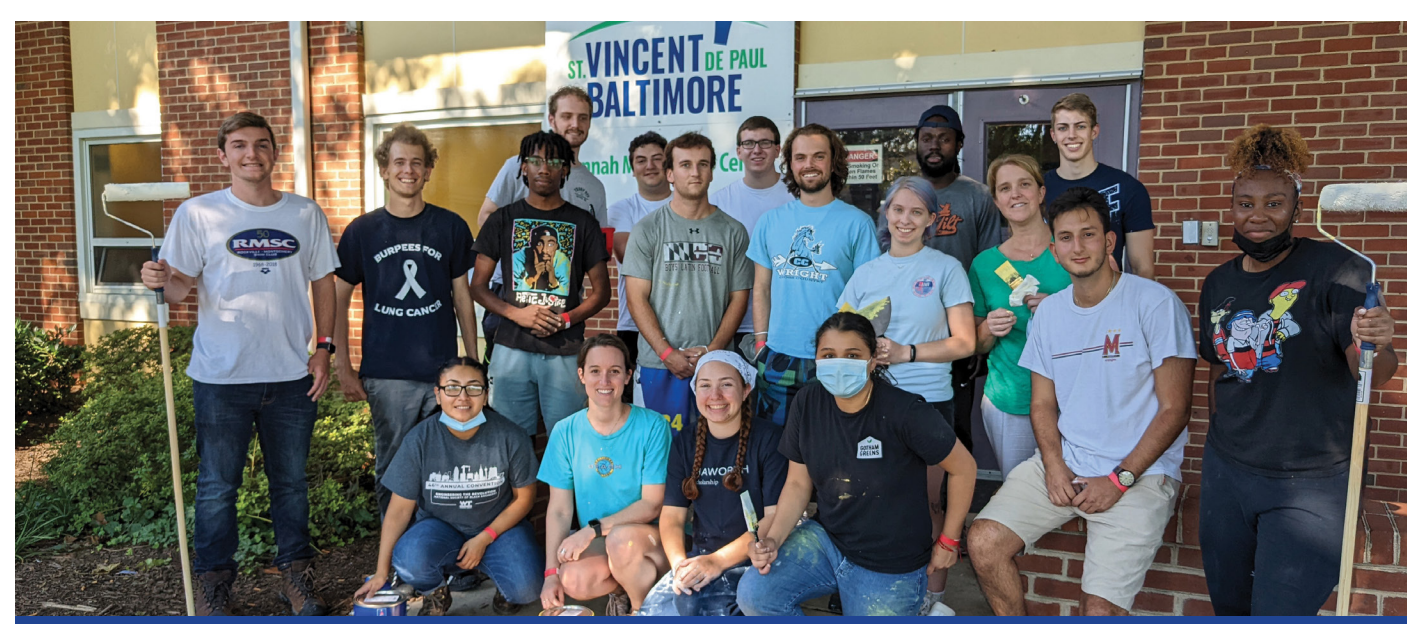
A team of 20 Whiting-Turner interns prepare a basement for a fresh coat of paint at Hannah More.

CE The H&S family of Bakeries is honored to celebrate 30 years of partnership with St. Vincent de Paul of Baltimore. A foundational part of our mission statement is to create meaningful change in the communities we serve in addition to aspiring to live our values in always doing the right thing. We look forward to many more years of giving back to SVDP and other local charities in the Baltimore area! <sup>33</sup>