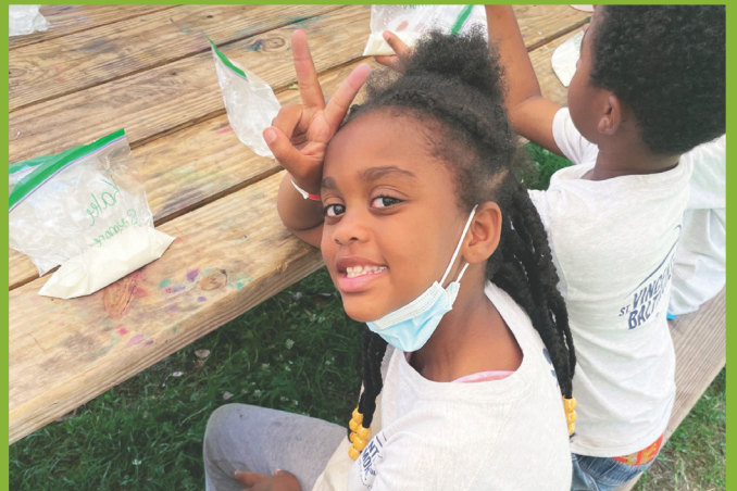
STEM projects that include ice-cream making lessons are both educational and delicious!