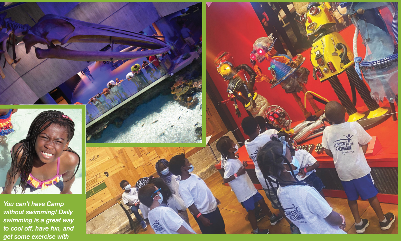
Two of the favorite field trips for Campers included trips to the National Aquarium and Visionary Arts Museum.