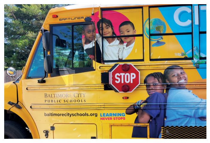
Thank you to Baltimore City Public Schools for donating the bus for our "Stuff a Bus" events.

There were four "Stuff a Bus" events during the month at different locations in Baltimore: Furley Elementary School, Hannah More, Sarah's Hope, and Arlington Head Start. Hundreds of donations flowed in providing residents with new clothes, personal items, linens and school supplies. Many thanks