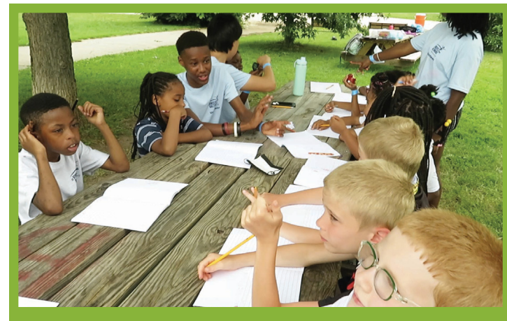
Campers prepare for their summer learning lesson under the shade of a tree. Campers routinely maintain or advance their reading and math skills over a summer at Camp St. Vincent.

loss. Campers enjoyed field trips to places like the Baltimore Aquarium, a skating rink, and a bowling alley, and experienced fun summer activities including swimming, dancing, theater, and art projects. Plans for 2023 are already underway, so please visit vincentbaltimore.org/camp to make sure it's another great summer for some very special children next year!